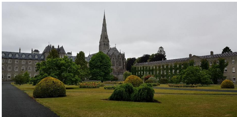
St. Patrick's College Maynooth

Overall, the content of the General Assembly was substantial and the beautiful campus of St. Patrick's College offered participants a calming venue to discuss matters related to its significant theme. As the photos below give witness, delegates were able to discern timely topics, exchange experiences and ideas, engage deeply in prayer, network among international colleagues and articulate potential future action plans.