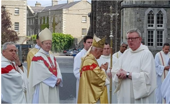
Preparing for Liturgy