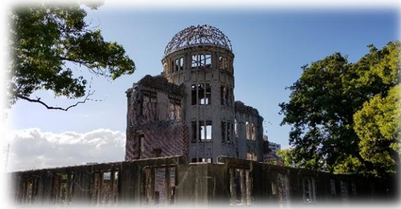
The Atomic Bomb Dome